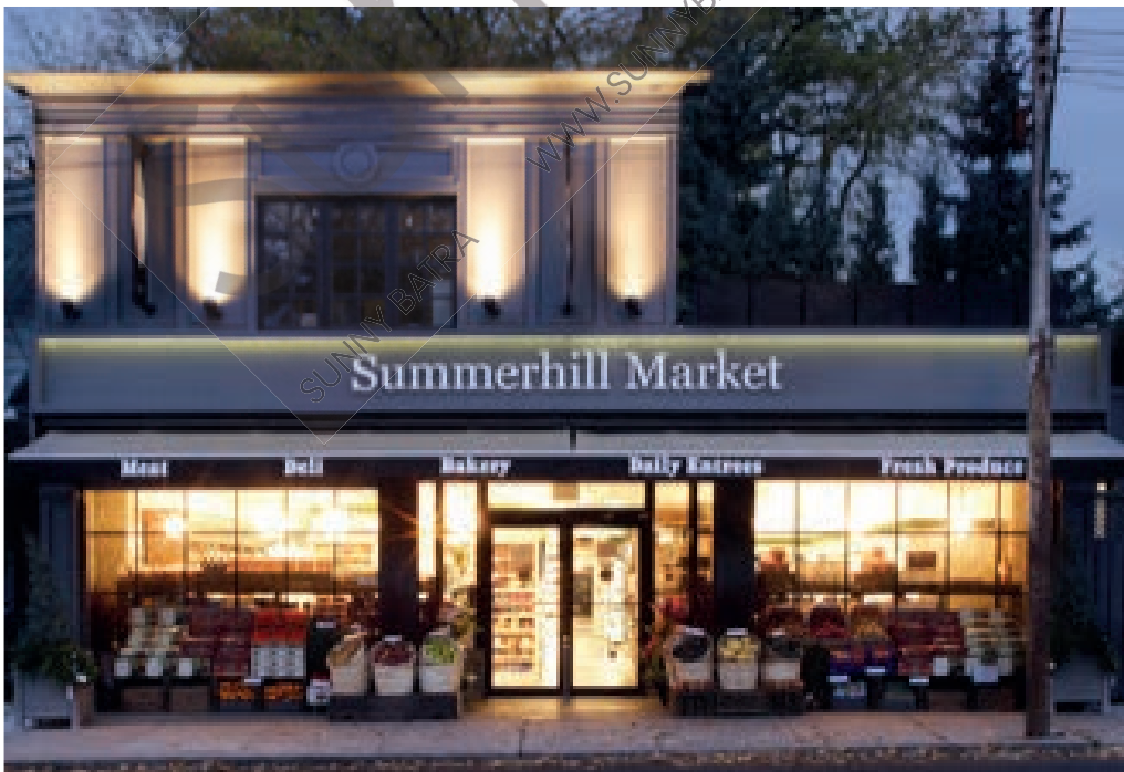
SUMMERHILL MARKET 1054 Mount Pleasant Road summerhillmarket.com