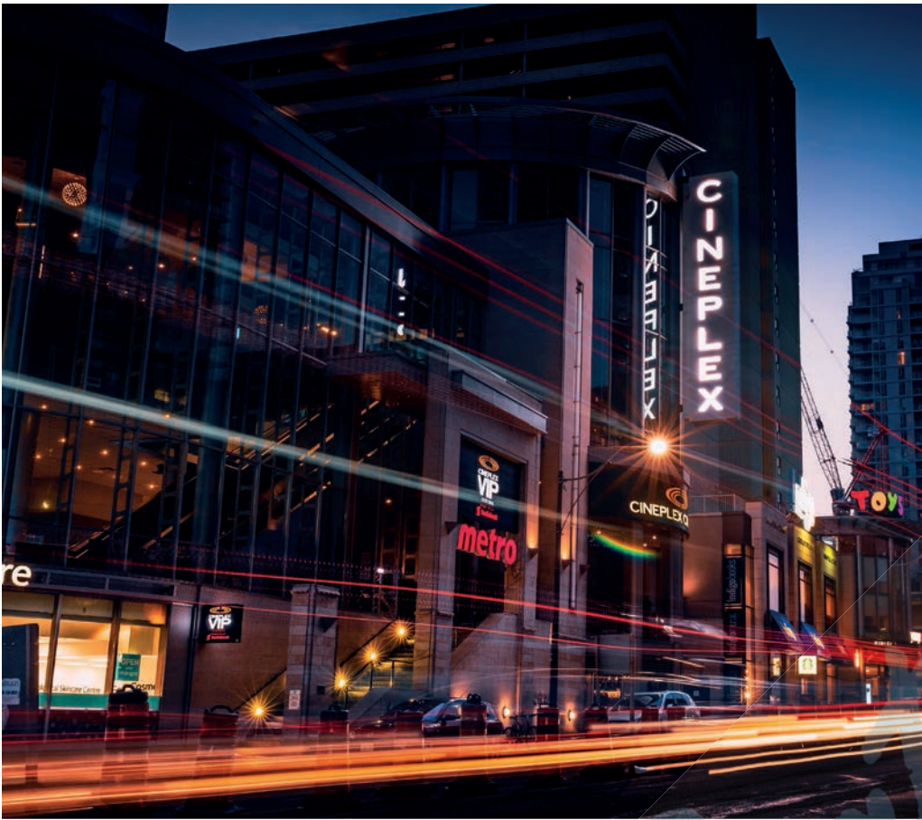
YONGE AND EGLINTON CENTER 2300 Yonge Street yongeeglintoncentre.com